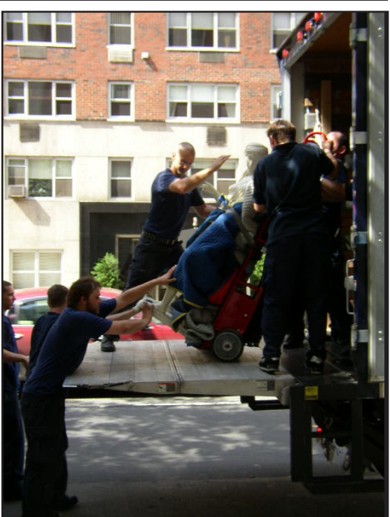
Art movers from Gander & White prepare the stairwell statuary for storage

The other half of Phase II consists of interior renovations, which are also well underway. Books and art objects have been removed from the Members' Room, Reference Room, and lobby for storage during the painting, sanding, polishing, and reupholstering planned for those spaces, the entry hall, and the main staircase. In addition, new carpets will be installed on the third and fifth floors and in the Members' Room. Although the Library had initially hoped this interior work could be accomplished without closing the whole building, our architect and contractors advise that the work will be significantly expedited by a two-week closing. We have scheduled this closing from July 1 through 16, a period that