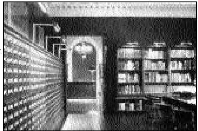
The Reference Room today: consultants are investigating efficient use of space.

We are pleased and proud to find that 31% of respondents have been supportive Library members for more than twenty years. Your suggestions are a big part of our continuing efforts to provide the best facilities and materials for all our members.